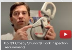
Ep. 31 Crosby Shurloc® Hook inspection requirements