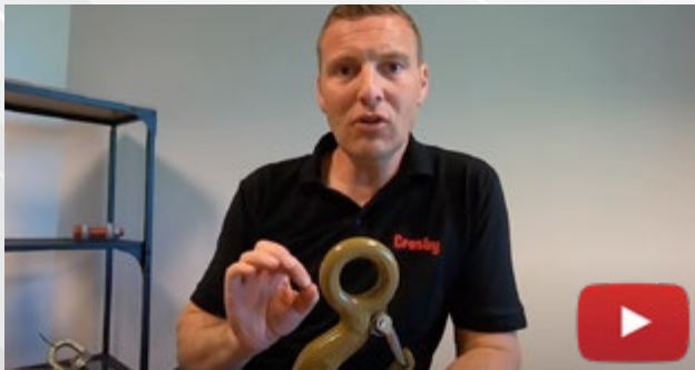
Ep. 21 Grinding and wear allowance on rigging hardware

4.5:1 Design Factor. Maximum allowable proof load is 2.5 times Working Load Limit. *Deformation indicators.