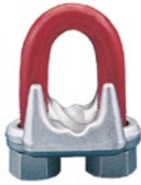
G-450 Red U-Bolt® Clip