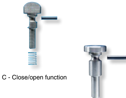
C - Close/open function