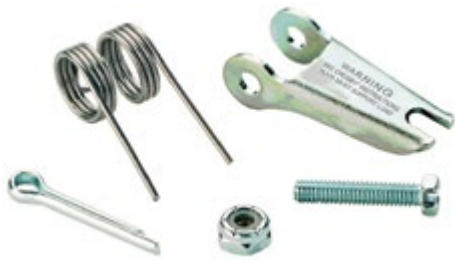
(For Crosby 319N, 320N, and 322N, S-1327, and A-1339 Hooks)