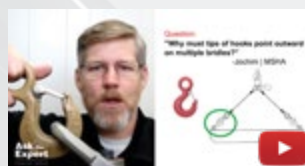
Ep. 5 Hooks: Why the tips must point outward on multiple bridle