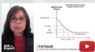
Ep. 36 Lifting & Mooring Fatigue: What is it and how to avoid it?

Watch all episodes and submit your questions at thecrosbygroup.com/podcast , and subscribe to our YouTube channel to catch every new video as soon as it's released.