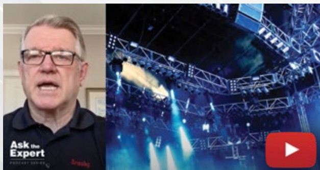
Ep. 46 Shackles designed for theatrical applications

APPLICATION AND WARNING INFORMATION SECTION 17