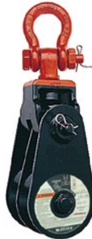
409 With Shackle