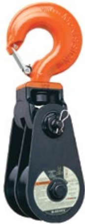
408 With Hook