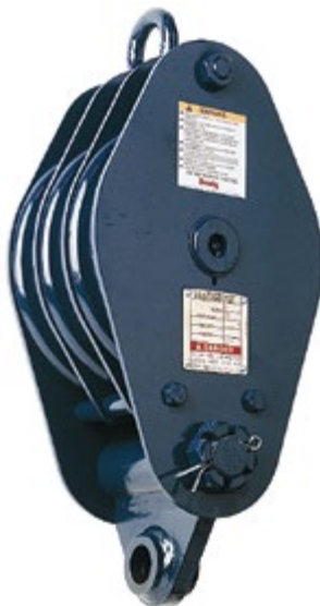
680 Construction Block with hanger