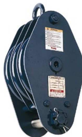
680 Construction Block bolt only

APPLICATION AND WARNING INFORMATION SECTION 17