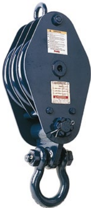
680 Construction Block with shackle