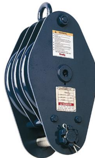
680 Construction Block bolt only

APPLICATION AND WARNING INFORMATION SECTION 17