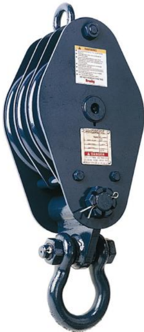
680 Construction Block with shackle