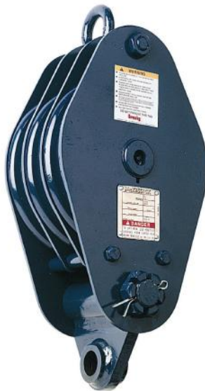
680 Construction Block with hanger