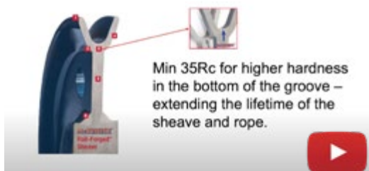
Ep. 30 Understanding sheave groove hardness