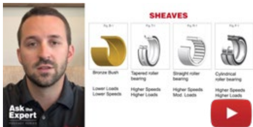
Ep. 27 Sheaves: bronze bushing vs roller bushing

Be sure to subscribe to The Crosby Group's YouTube channel to catch every new video as soon as it's released.