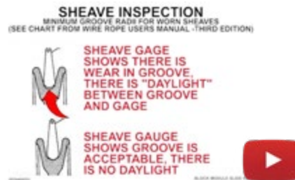
Ep. 32 How to know when it's time to replace sheaves