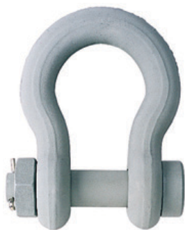
G-2130CT / G-2140CT