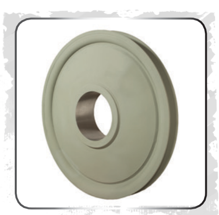
U.S. Patents D621, 240

McKissick® Domed Roll-Forged sheaves are welded in a circular pattern thus eliminating the higher stresses created by welding ribs or other forms of stiffeners.