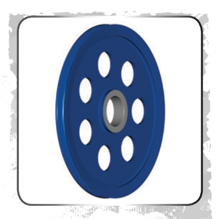
Large Range of Sheave Sizes Available

McKissick fabricated sheaves are available with machined groove rings or machined forged rings utilized for the rim or hub.