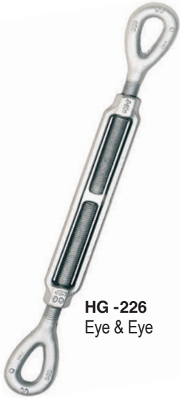
HG -226 Eye & Eye

Meets the performance requirements of Federal Specifications FF-791b, Type 1 Form 1 - CLASS 4, and ASTM F-1145, except for those provisions required of the contractor. For additional information, see page 452.