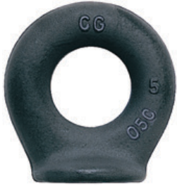
S-264 Pad Eye