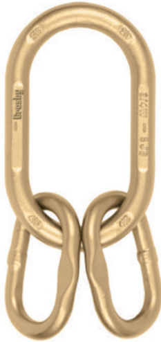
A-345 Alloy Master Links