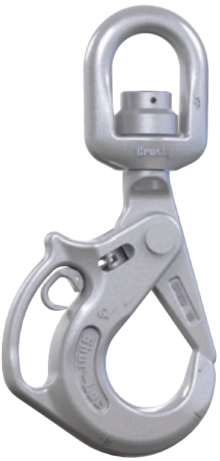
S-13326AH SHUR-LOC® Handle Swivel Hook with Bearing