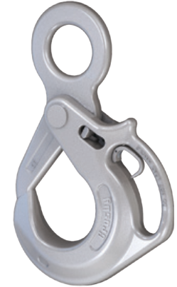
S-1316AH SHUR-LOC® Handle Eye Hook