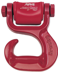
S-287 CHOKER HOOK