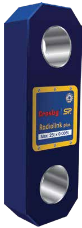
Wireless Dynamometer [RLP]

This lightweight wire rope tension meter provides fast and accurate measurement of cables and guy wires up to 11,000lb/5000 kgf and up to 1"/25mm diameter. Manufactured using an integral, high accuracy Bluetooth module, the COLT transmits load data wirelessly to any smart device running Crosby SP's Android or iOS app. Typical applications include cell tower or flare stack guy lines, median barrier cables and fall arrest