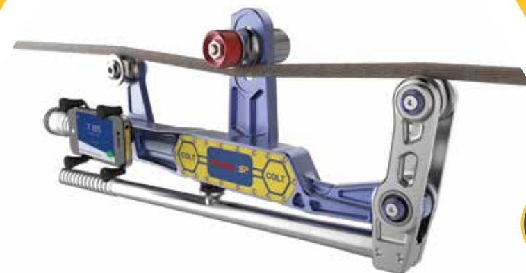
Clamp on Line Tensionmeter [COLT]