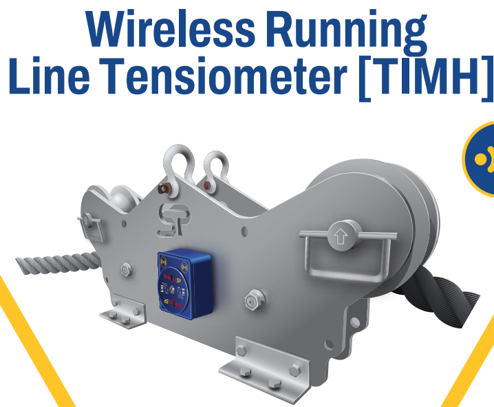
Wireless Running Line Tensiometer [TIMH]