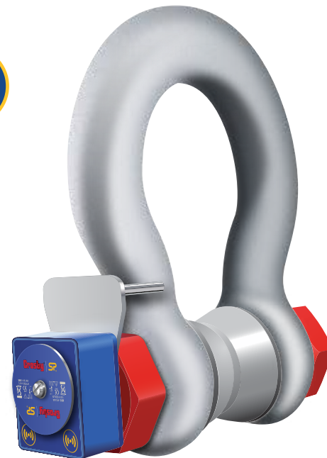
Wireless Loadshackle [WLS]

Safety, reliability and quality are paramount in the lifting and rigging industries - Crosby SP designs and manufactures to the highest standards including ISO9001, ATEX and DNV Type Approval.