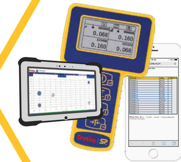
On-board Display Dynamometer [LLP]