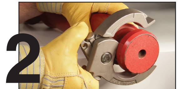
Push collar onto bolt