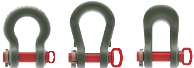
G-2140(E) Alloy Shackles 200t, 250t, 300t