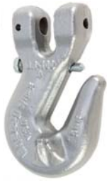
L-1338 Cradle Grab Hook with Latch