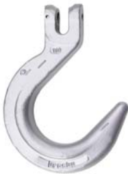
A-1359 Clevis Foundry Hook