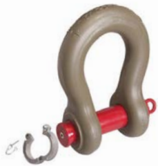
G-2140E Crosby Easy-Loc®

G-2140 meets the performance requirements of Federal Specification RR-C-271F, Type IVA, Grade B, Class 3, except for those provisions required of the contractor. For additional information, see page 468.