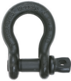
S-209T THEATRICAL SHACKLE