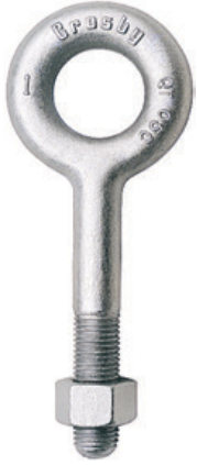
G-291 Regular Nut Eye Bolt