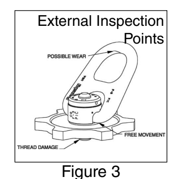
180' PIVOT 360' ROTATION