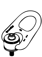
HR-1000 (Red Washer) HR-1000M (Silver Washer) HR-1000CT (Blue Washer)