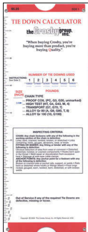
Tie Down Calculator

This brochure translates the rigging requirements established by OSHA concerning lifting personnel into various types of components that could be used to comply with the intent of the regulation.