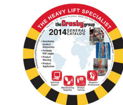
General Catalog on DVD

The same comprehensive information as our General Catalog. Only a mouse click away.