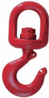
Suitable for frequent rotation under load.